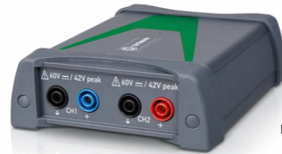
Measurement module MT-USB

The optional MT-USB connects to the mega macs X via the USB socket and turns it in to a practical two-channel multimeter for voltage measurements of up to 60V, as well as current and resistance measurements (subject to licence type).